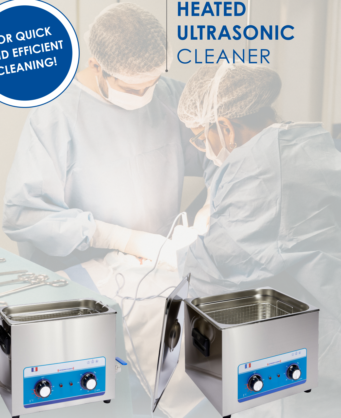
Ultra-C6 6 liters