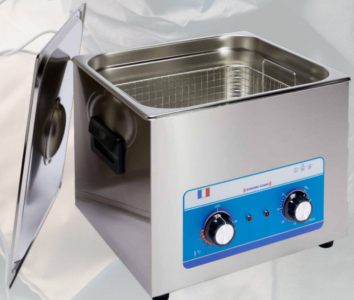
Ultra-C15 15 liters