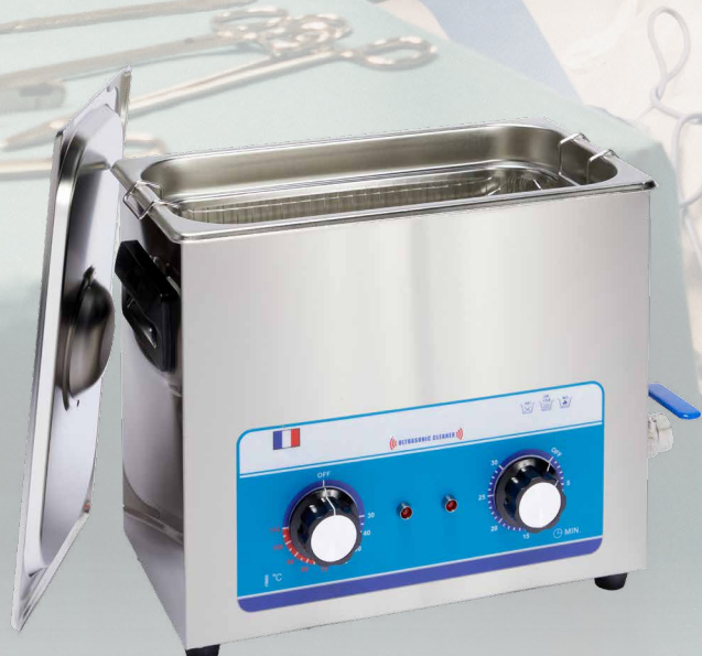
Ultra-C6 6 liters